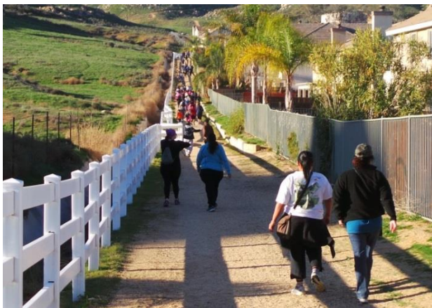
Hike to the Top Participants