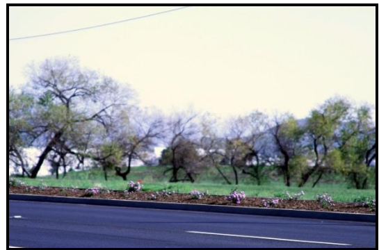
After - February 5 th