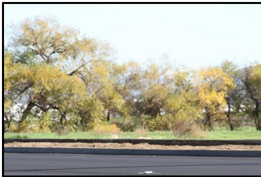
Before - January 14 th

Landscape crews installed mulch and plants in the Alessandro median, east of Frederick. Given the drought conditions, this is the only area scheduled for replants. Prior to the replants, there was no vegetation, just boulders and accumulated dirt.