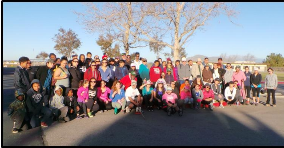
Hike to the Top Participants