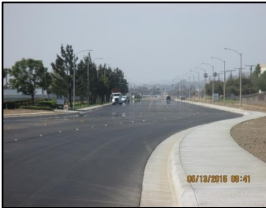
Looking south, paving complete south of bridge. Here is where the four lanes of road widening will connect to existing improvements.

pavement within the same project limits. Sidewalk and streetlights are also proposed as part of the project. Eastern Municipal Water District, Western Municipal Water District, and Southern California Edison have relocated their respective facilities. Construction is nearing completion, with all improvements excluding pavement striping and hydro seeding of adjacent parkway areas. When completed, the project improvements will facilitate access and economic vitality to an area that currently includes Proctor and Gamble, Amazon, and Cardinal Glass. The project is primarily funded with Western Riverside Council of Governments (WRCOG) Transportation Uniform Mitigation Fee (TUMF) funds and supplemented with Measure A funds. Construction is anticipated to conclude by October 2015 (weather permitting).