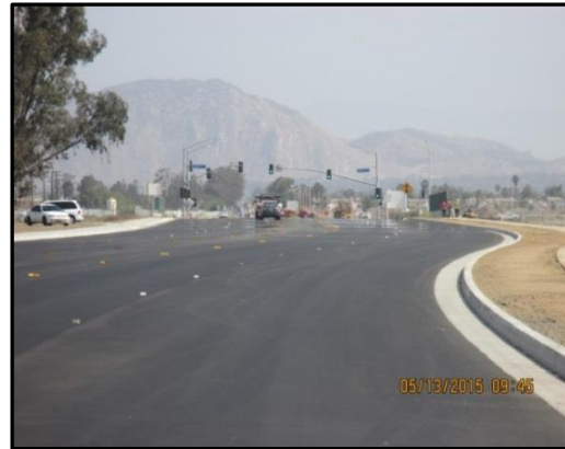
Looking north, paving complete south of bridge. Additional widening will create four lanes plus a continuous turn lane.