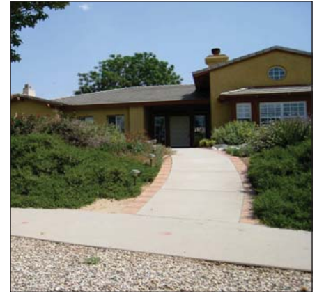
Water conserving landscaping

In an effort to meet state guidelines to conserve one of our most precious resources, the City Council recently revised the City Landscape Requirements and Guidelines to require landscapes that are aesthetically designed with water conservation principles such as the use of advanced irrigation systems and low water use plants.