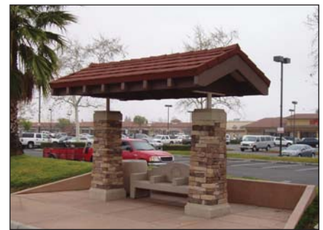
The City has already received many positive comments about the new bus shelter design.

Construction of the $12 million beautification project along the 2-mile corridor of Sunnymead Boulevard between Frederick Street and Perris Boulevard is scheduled for completion in March 2010. The first two phases of this 3-phase project have been completed: Phase One consisted of a pipeline replacement funded by Eastern Municipal Water District; Phase Two consisted of sidewalk and parkway improvements funded by the City's Redevelopment Agency; and Phase Three consisting of 'in-street' beautification improvements including decorative concrete in the center turn lane and landscaped medians, is currently being constructed. This last phase is funded by a Federal grant.