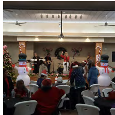
Thee Champagne Band